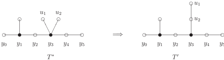
Fig. 2 Two trees T^* and T'

We can further claim that T^* possesses only vertices of degree 1, 2 and 3. Otherwise, suppose P = y_0y_1\dots y_ly_{l+1} is the longest path of T^* , then there exists a vertex y_i ( 1 \leq i \leq l ) such that \text{deg}(y_i) \geq 4 . Assume that \{y_{i-1}, y_{i+1}, u_1, u_2, \dots, u_t\} is the set of the neighbors of y_i , where u_1, u_2, \dots, u_t ( t = \text{deg}(y_i) - 2 ) are pendent vertices. Let T' be the tree obtained from T^* by deleting the edge y_iu_1 and joining u_1 to u_2 . See Figure 2 for an example. Clearly, T' \in \mathbb{BT}_{n,r} .